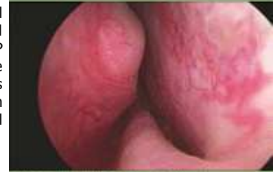
Endoscopic view of prostate - a document