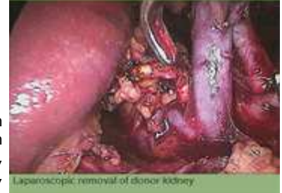
Laparoscopic removal of donor kidney