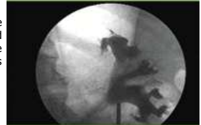
C-arm imaging - documentation of pathology